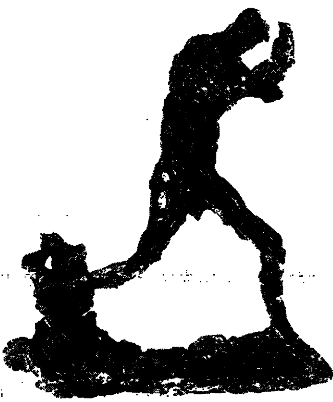
"St. George," by Fontana, 1935.

of the holes and slashes and assumed the appearance of what might be described paradoxically as an "expressionistic minimalism."